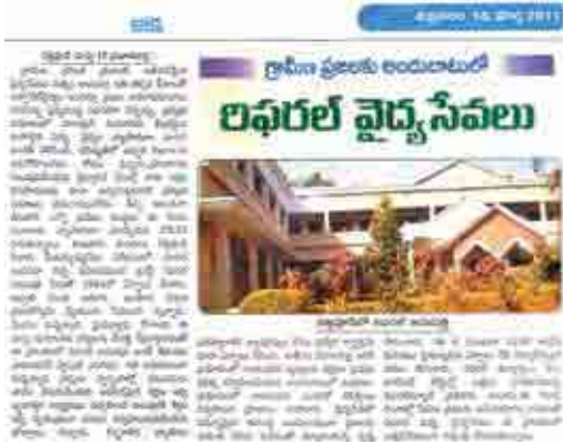
Reported by VAARTHA daily, dated Friday 18, March 2011.

In the picture: Referral Hospital at Kathipudi.