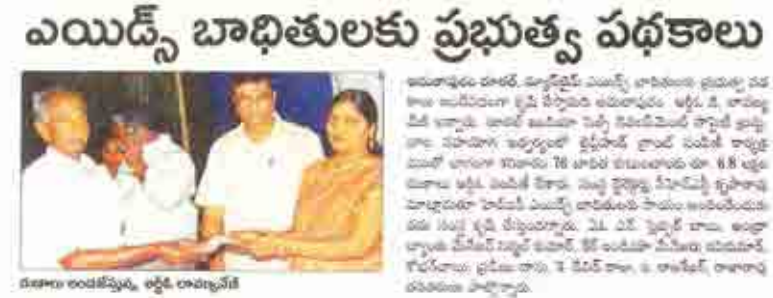
Reported by SAKSHI daily, dated Sunday, 9 January 2011

In the picture: Livelihood grant being handed over by government official. Under the Balasahyoga program of RISDT, 76 families were provided with the Livelihood Grant to the tune of Rs.0.68 millions. All the families are affected by HIV/AIDS. Revenue Divisional Officer who participated in the grant distribution program and appreciated the various health initiatives undertaken by the RISDT.