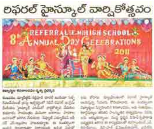
Reported by SAKSHI daily, dated Saturday, March 5, 2011

In the picture: Students performing a mythological play Grand celebrations had witnessed during the 8th Annual Day of Referral High School. The occasion was graced by the deputy educational officer who called upon the students and teachers to imbibe discipline with high academic standards. He also praised the services of