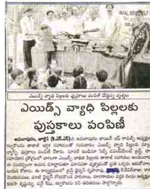
Reported by ANDHRAPRABHA daily, dated Friday, July 2, 2010

In the picture: Books distribution arranged by RISDT Under the initiative of RISDT to help the children affected by HIV/AIDS, school bags and books were distributed to the children. RISDT organized the program jointly with individuals and organizations for the benefit of the children to continue the studies.